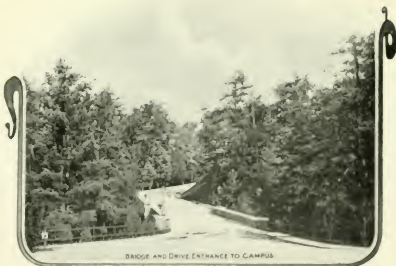
BRIDGE AND DRIVE ENTRANCE TO CAMPUS